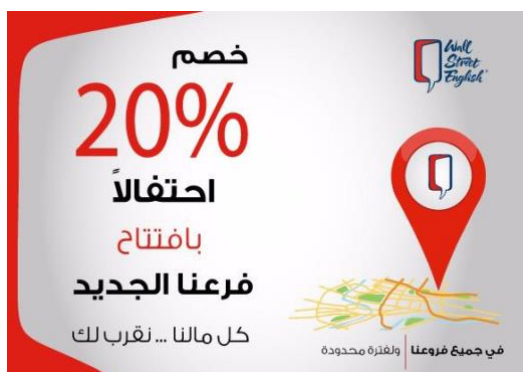
Figure 8: Offering 20% extra savings (WS7)

Translation: 20% discount to celebrate the opening of our new branch. Come join us.