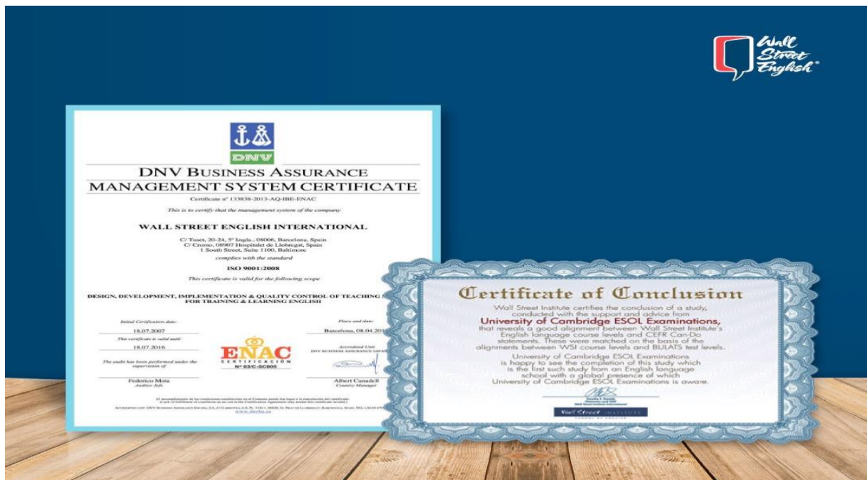
Figure 6: Accreditation in advertisement (WS5)

Citing the accreditation of an authorized organization to certify the institute’s competency and credibility is another means of establishing credentials in the advertisements. To increase their potential students’ trust, some institutes indicate in their advertisements that they are accredited with international organisations such as Cambridge Assessment English,