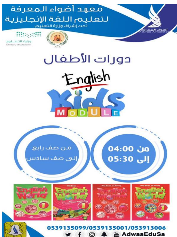
Figure 2: English is fun (AA9)

an image appear more than real (Ly & Jung, 2015). The depth in these images is natural.