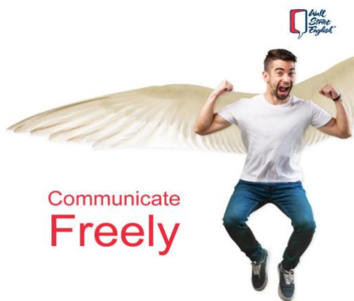
Figure 4: "Communicate freely" advertisement (WS6)

In Figure 3, a stylized cartoon character of a young man is sitting on the left side of the picture, reading a book. The phrase written in the centre says, “Today a reader, tomorrow a leader.” Leadership, in this advertisement, is assumed to be achieved by learning English. The phrase refers to the bright future that English learners will experience due to the benefits