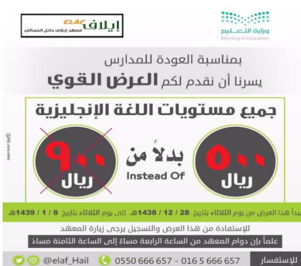
Figure 9: Code-switching as symbolic communication (EH2)

The Arabic language is used to convey information as observed in the advertisements in this study. Arabic is used to introduce the most essential information about the service. For example, the Arabic language