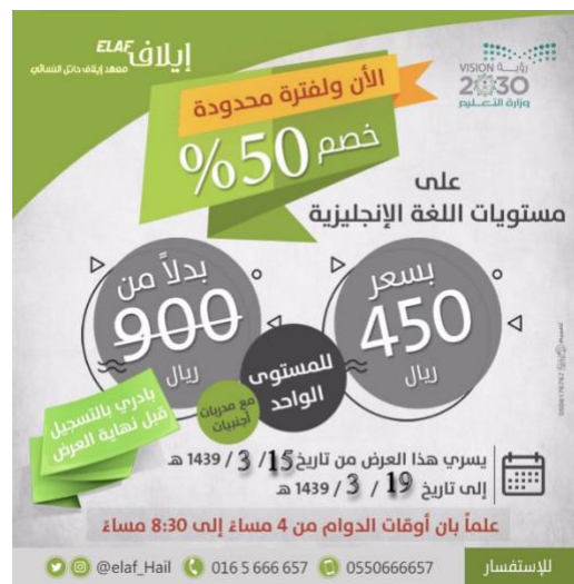
Figure 7: Offering 50% extra savings (EH1)

For example, the advertisers may offer extra savings if the customer decides to enrol in the institute before a specific deadline. Figures 7 and 8 are examples of this move; one offers 50 percent additional savings and the other 20 percent. The advertisers put pressure on the potential customers to prompt an immediate decision about the service offered by the ELT institute. Customers are cautioned about the limited time of the offer,