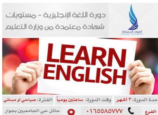
Figure 11: Code-switching (AA8)

CS is used for the name of the institutes and some other phrases meant to attract the