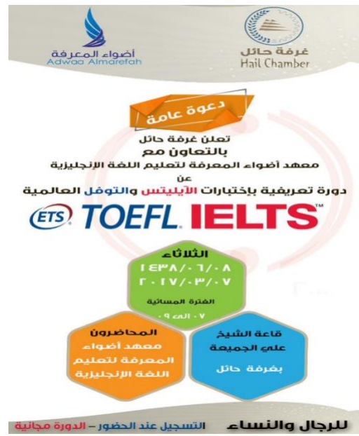
Figure 10: Announcing the IELTS and TOEFL (AA2)

Translation: English language course – levels. Accredited certificate from the Ministry of Education.