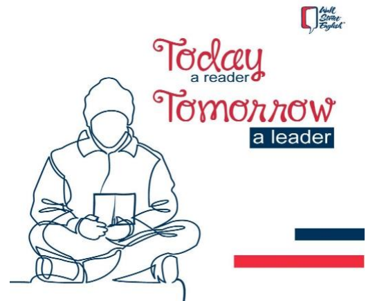
Figure 3: English and leadership (WS2)

Another facet of English emphasized in the data is the importance of learning English in empowering and developing individuals. This is clearly illustrated in Figures 3, 4, and 5. These ads demonstrate the increasing emphasis on efficiency, accountability, and development of human capital through learning English.