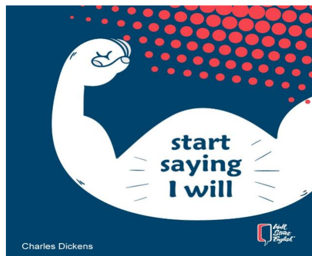
Figure 5: "Start saying I will" advertisement (WS10)

Taken together, the description of these three ads demonstrates that language education in Saudi Arabia is increasingly influenced by neoliberalism. English learning is conceptualised as a form of linguistic entrepreneurship , an act of moving beyond the borders of the ones' linguistic community to find new contexts in which linguistic recourses are enhancing their value in the world