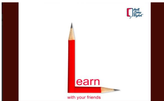
Figure 12: English advertisement and Arabic tweet (WS11)

Other advertisements found in the institutes’ Twitter accounts use pictures that are entirely in English while the Tweet itself is in Arabic, as shown in Figure 12. The presence of English either in the form of CS, as loanwords, or throughout the whole advertisement functions like a visual display of the product (i.e., English). The Arabic language, on